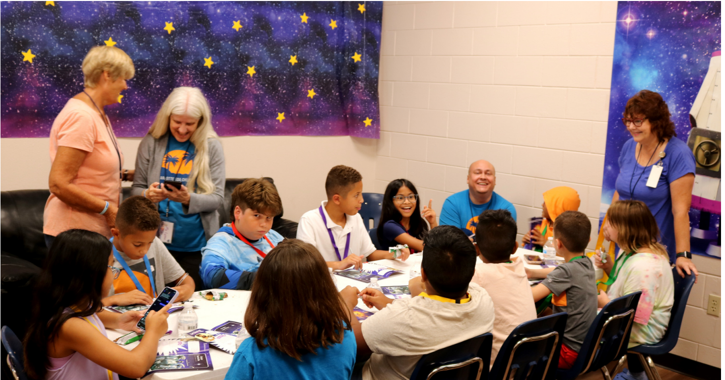
Photo of VBS volunteers